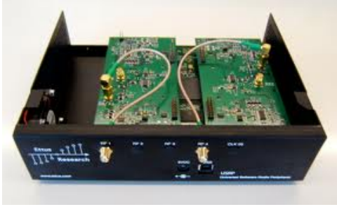
Figure 4. Ettus Research USRP1 kit.