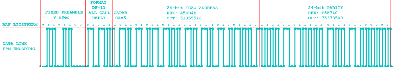
Figure 2. PPM-encoded ADS-B 56 bit sample frame.

probability of existence Mostly observed in intentional or unintentional prankster group, as shown in [47];