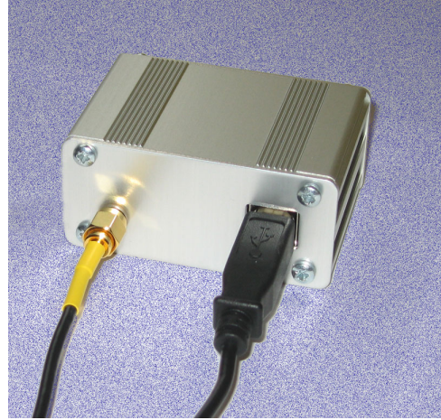
Figure 6. PlaneGadget ADS-B Virtual Radar.

1) Overview: As our main software base, we are using the GNURadio [48] open-software package. GNURadio is