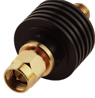
Figure 3. Attenuator VAT-10W2+.